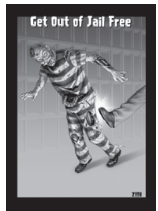
"Get Out of Jail Free" card