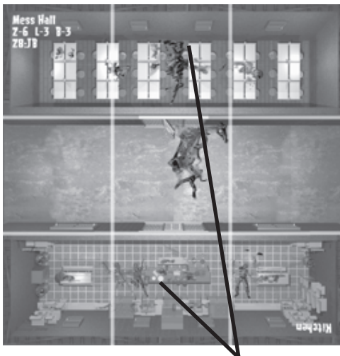
Mess/Kitchen Tile - Both sides are accessible!